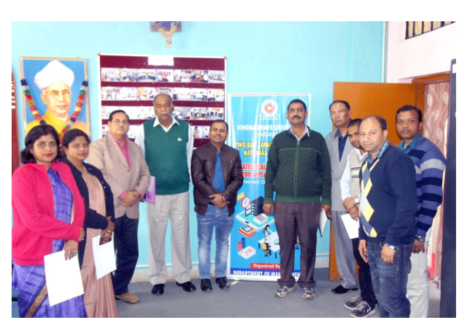
Workshop on "Statistical Data Analysis" organized on 23-24 February 2019

The Department runs in a well-equipped infrastructure, constructed from the funds provided by the University Grant Commission. The faculty is dedicated to produce goal oriented and value