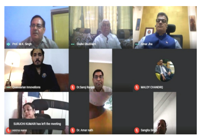
Webinar on Start-up India on 28th April 2021

The campus has Wi-Fi connectivity of 1 mbps and the classes are equipped with SMART CLASS Technology. The Department is equipped with computer lab, library cum reading room, students club, yoga & meditation centre and health care centre. Gymnasium, indoor stadium and outdoor stadium, auditorium (Vivekanand auditorium), canteen apart from other facilities are shared by the students of other faculties in the campus.