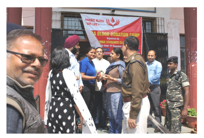
"Mega Blood Donation Camp" organized on 04 March 2020

The University Department of Management, Vinoba Bhave University, Hazaribag, was established in the year 2008. The Management Programme (Two years Full time MBA) started from the session 2009-11 as per the approval of AICTE, New Delhi and HRD, Govt. of Jharkhand State.